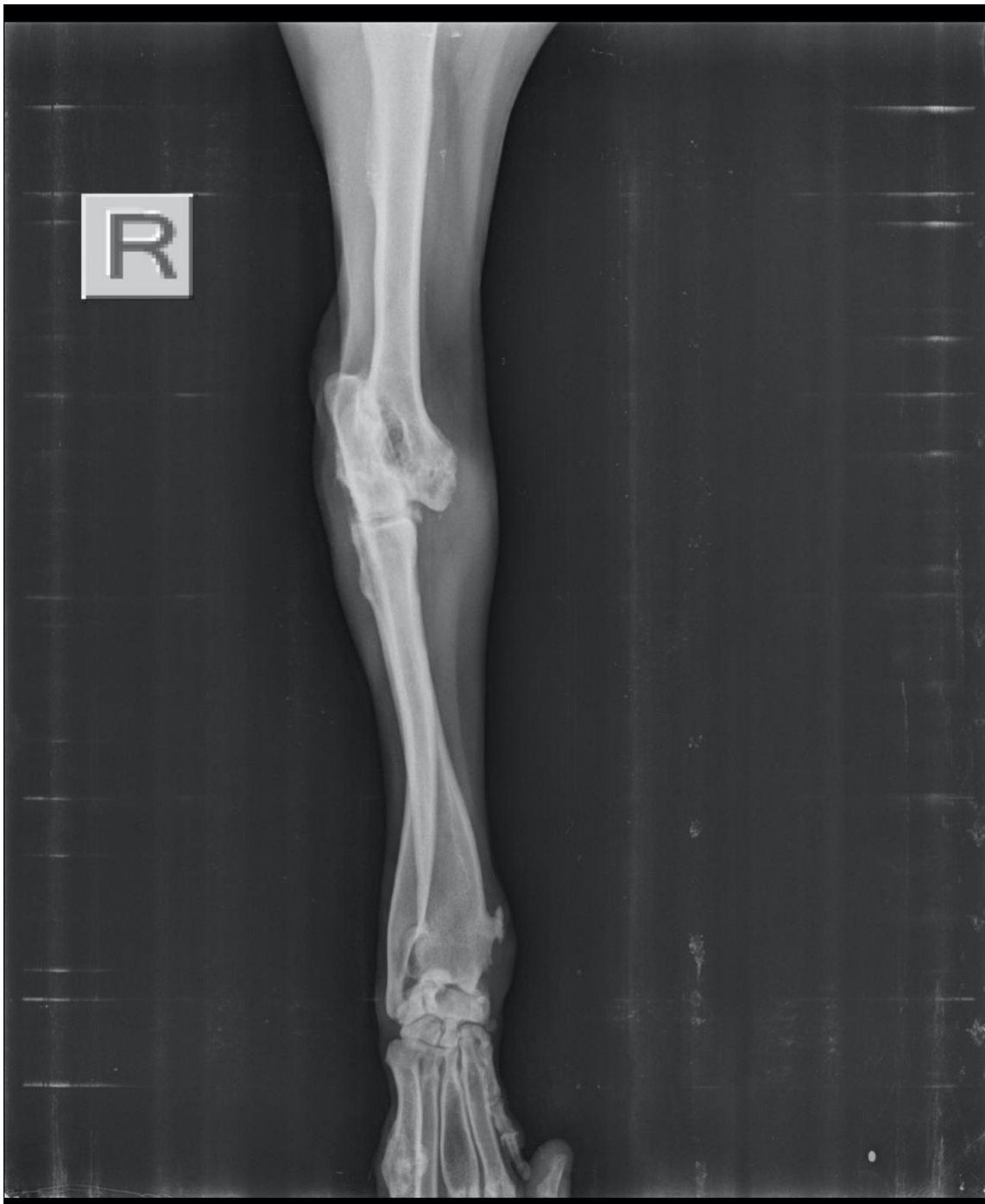
chronic right elbow subluxation with moderate to severe osteoarthritis